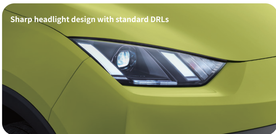
Sharp headlight design with standard DRLs