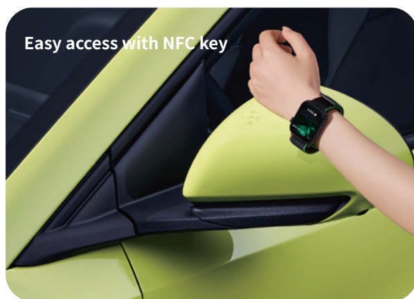
Easy access with NFC key